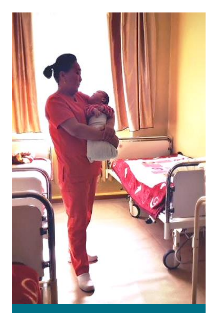
This baby was abandoned at birth and placed in the care of a special institution that takes care of babies without families. Because her mother was gone, she was not able to breastfeed or receive breastmilk.