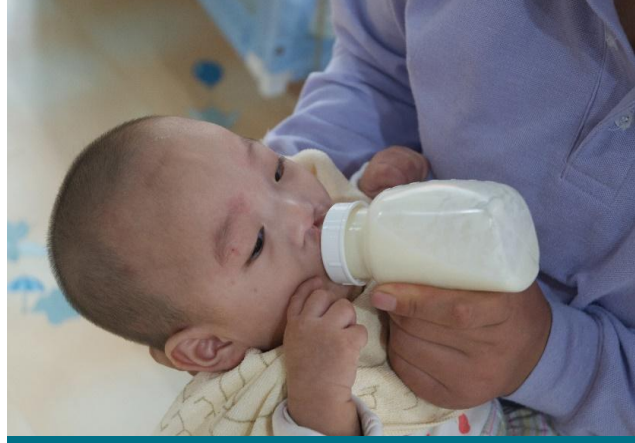
This young baby was born with a cleft lip and palate, which made breastfeeding more challenging.