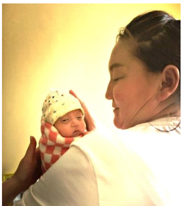
This tiny newborn was born several weeks early. He needed special care at the hospital, which took him away from his mother. Breastfeeding was hard because he was so small and weak.